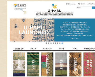
U-PARL website offering Asian studies-related information: http://u-parl.lib.u-tokyo.ac.jp/