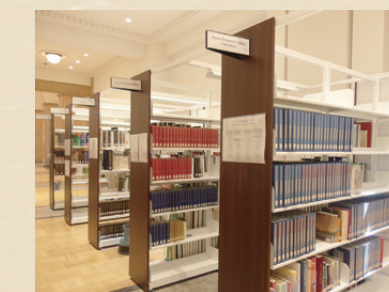
Asian Research Library resources are available on the third floor of the Main Building in advance of the opening on the fourth floor.

The way how the library operates is constantly changing, but its core is always the materials it houses. U-PARL is developing the collection of the Asian Research Library through the three approaches of purchasing new materials, accepting donated materials, and integrating materials from the university’s libraries and reading rooms.