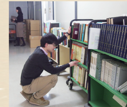
Supporting development toward opening of the Asian Research Library planned for October 2020.