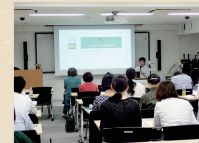
“Persian and Arabic Books” Providing a forum for researchers and librarians to engage in wide-scale collaboration, share understanding of various issues, and learn together.