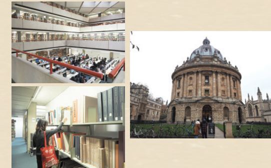
[Left top and bottom] Visiting the SOAS Library [Right] Visiting the Bodleian Libraries, University of Oxford