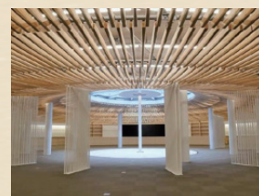
Library Plaza, General Library (Annex, B1F)

After completion of the current renovation work, the fourth floor of the General Library Main Building will be home to the open-stack floor of the Asian Research Library. The General Library is the central library of the University of Tokyo Hongo Campus and is composed of the Main Building, boasting a ninety-year history, and the Annex, which was completed in 2017. There are also plans to house Asian Research Library resources in the automated storage and retrieval system of the Annex.