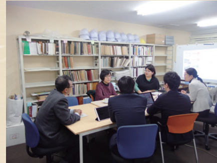
Exchange with the East Asia Library, University of Washington