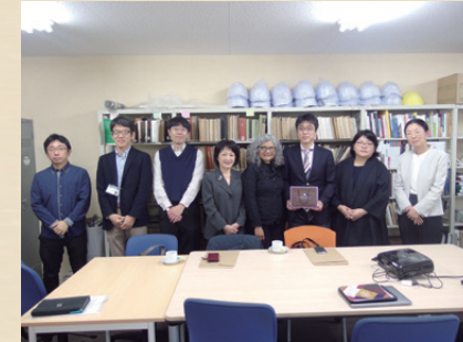
Exchange with the University of Hawai'i at Mānoa Library