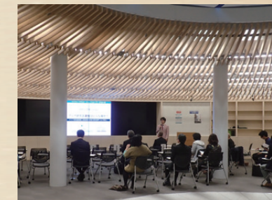
Event at Library Plaza

In world-class research libraries, subject librarians equipped with specialist knowledge in each field of research are responsible for developing the library collection and supporting leading-edge research activities. Through communication with domestic and foreign research libraries, U-PARL is exploring the roles that should be fulfilled by Asian studies specialists in research libraries.