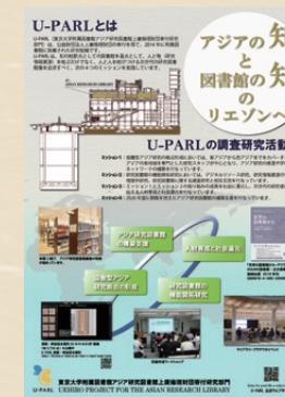
Publicity activities to broaden recognition of U-PARL and its work are also undertaken.