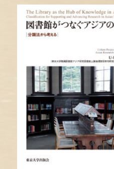
The Library as the Hub of Knowledge in Asia: Classification for Supporting and Advancing Research in Asian Studies (Edited by U-PARL, University of Tokyo Press, 2020, ISBN 978-4-13-003602-3)

U-PARL is proactively sharing information on Asian research.