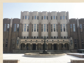
General Library (Front View)