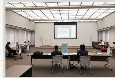
International Symposium on the Chinese Literature and Digitalization

In the second phase (2019 to 2023 school years), U-PARL is focused on carrying out activities aimed at forming a cooperative hub for Asian studies, breaking new ground in the study of research library functions, cultivating human resources and contributing to society.