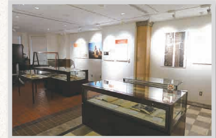
Exhibit on Digital Collections and Original Documents