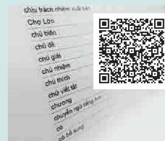
"Vietnamese and Thai Glossary for Librarians" (in Japanese)